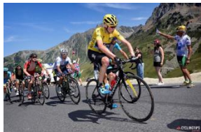
Long distance cycling