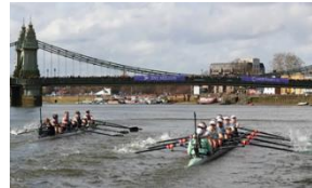
Long distance rowing